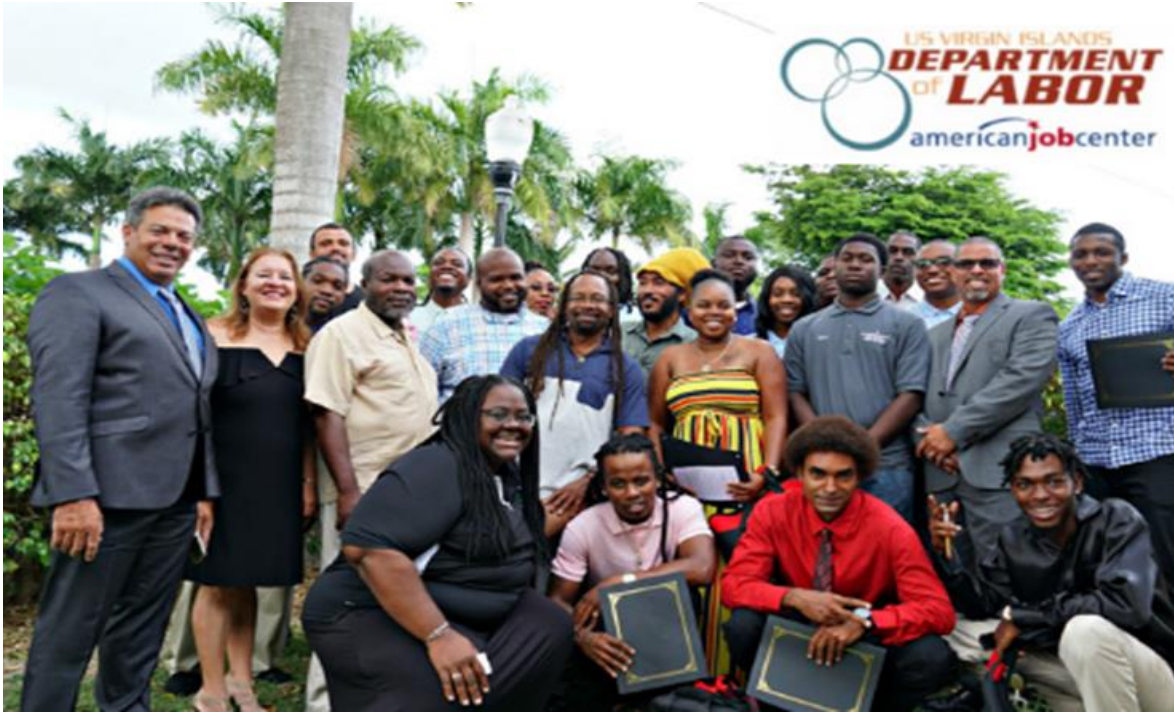
Netwave LLC 2019 Graduates - 23 St. Croix residents completed the training program and received Fiber Optic Technician & Installation Certification.