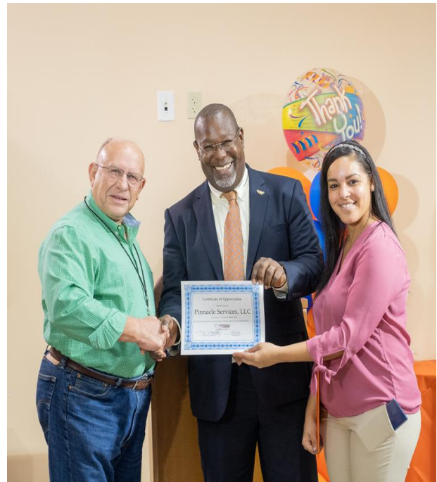
St. Croix Recognition Award was presented to Pinnacle Services LLC.