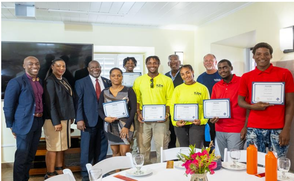
Apprenticeship Program with Pinnacle Services LLC. A ceremony was held to give recognition to the 22 residents certified by the National Center for Construction Education and Research (NCCER).