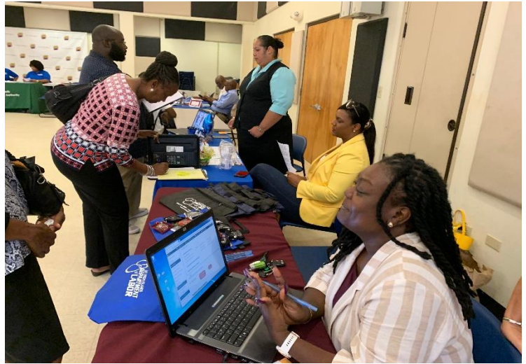
Job Fair held at the University of the Virgin Islands St. Croix Campus