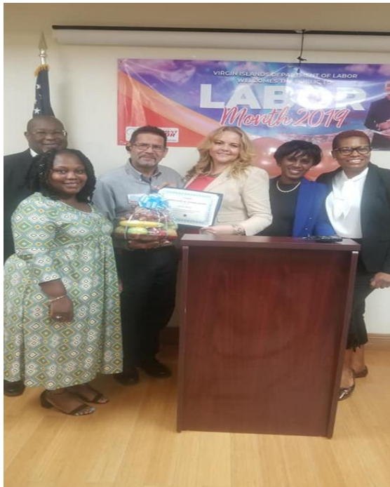
St. Thomas Recognition Award was presented to Auto Zone.