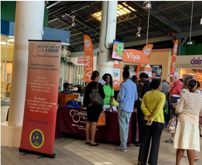
Job Fair held at the St. Thomas Tutu Park Mall