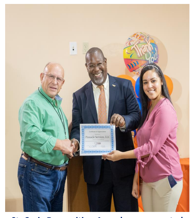
St. Croix Recognition Award was presented to Pinnacle Services LLC.