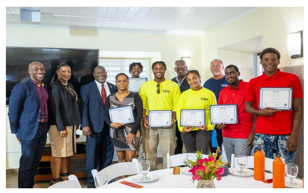
Apprenticeship Program with Pinnacle Services LLC. A ceremony was held to give recognition to the 22 residents certified by the National Center for Construction Education and Research (NCCER).