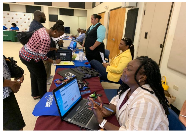
Job Fair held at the University of the Virgin Islands St. Croix Campus