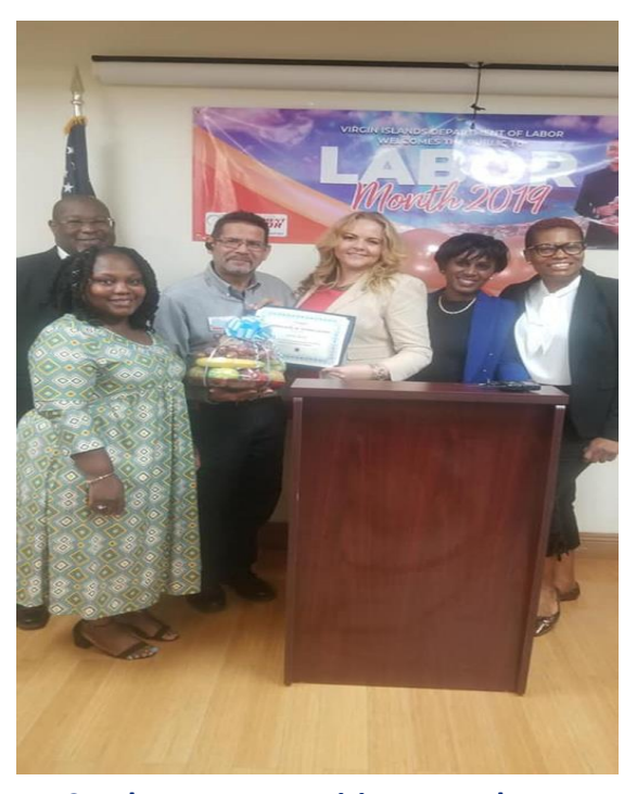
St. Thomas Recognition Award was presented to Auto Zone.