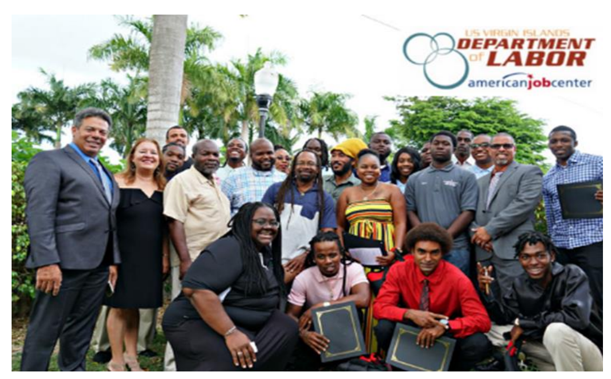
Netwave LLC 2019 Graduates - 23 St. Croix residents completed the training program and received Fiber Optic Technician & Installation Certification.